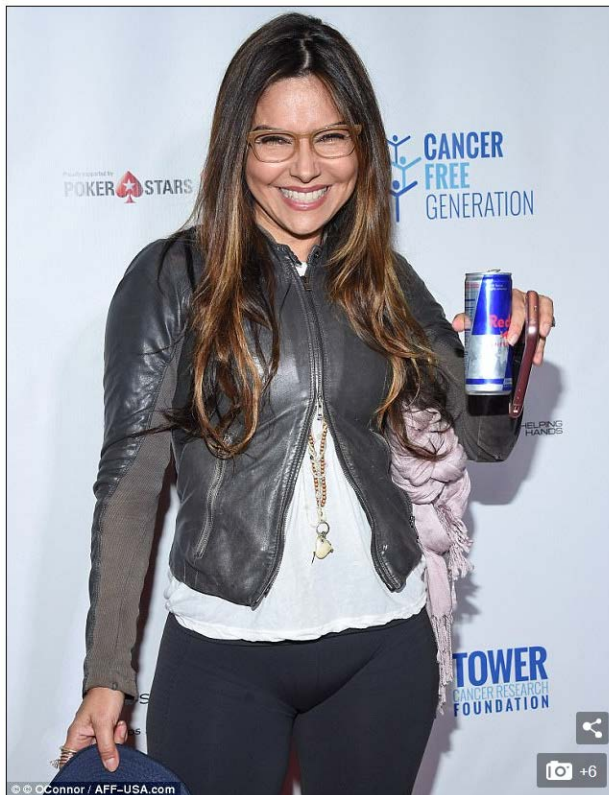
Cheers: Vanessa Marcil from General Hospital fame rocked a chic leather biker jacket