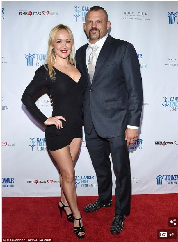
Big guns: Former UFC champ Chuck Liddell arrived in a dapper suit with a stunning blonde by his side